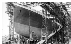
Harland and Wolff

Titanic was built at their shipyard in Belfast