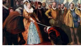
1581 – Queen Elizabeth 1 knighted Sir Francis Drake.