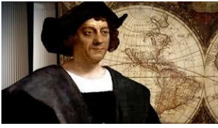
1492 – Christopher discovered America