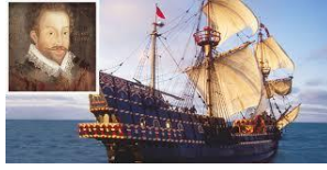
1577 – 1580 – Sir Francis Drake sailed around the world.