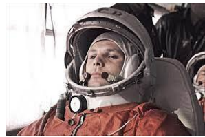
1961 – Travelling in the Vostok 1 capsule, Gagarin completed one orbit of Earth on 12 April 1961.