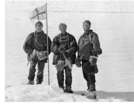
1901-1904 – Sir Robert Scott travelled in Antarctica to reach the South Pole.