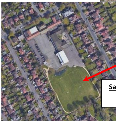
Satellite Map of Brooklands Primary school