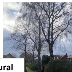
Physical Features – natural