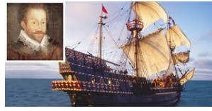
1577 – 1580 – Sir Francis Drake sailed around the world.