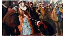
1581 – Queen Elizabeth 1 knighted Sir Francis Drake.