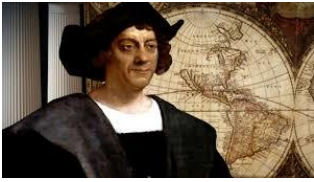
1492 – Christopher discovered America