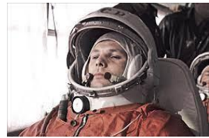
1961 – Travelling in the Vostok 1 capsule, Gagarin completed one orbit of Earth on 12 April 1961.

Neil Armstrong was a famous American astronaut. He is most famous for being the first man to step foot on the moon - one of the greatest achievements in human history.